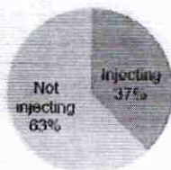
Respondent Injecting harmonics